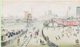
A View of York (from Tang Hall Bridge)

Derwenthorpe has a cycle path (Sustrans Route 66) that runs through it towards the city centre from Osbaldwick, on the track bed of the former Derwent Valley Light Railway. When it was a railway line, it was used by Joseph Rowntree factory employees to travel to work. It was nicknamed "the Blackberry Line" as it was used to transport blackberries to Yorkshire and London markets, when it linked to the main line at Selby.